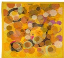
Cancion Amarillo, based on the music of Karl Jenkins