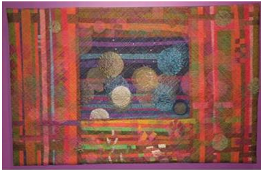
Mexican Celebration, fabric collage

creative expression than traditional techniques.