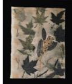
Eco dyed Leaves