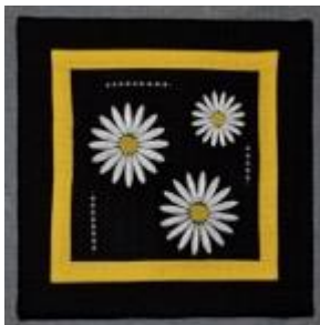
Black and White Challenge

I get my inspiration from nature, colours, attending workshops, group activities, Show and Tell, other fibre artists and challenges. When I first joined OOTB, I was still a member of the Ottawa Valley Quilt Guild. For one of our quilt shows, we were given the name of a flower and our challenge was to make a small quilt using a square, an embellishment or quilting design to name the flower. Then at the show participants viewing the quilt would use the square embellishment or quilting design to guess the name of the flower. My flower's name was Sea Holly. The hat is made of blue feathers with rhinestones in the centre and looks like the flower. The ladies rhinestone ear ring is in the shape of a C and the quilting design is holly. This was my first fibre art piece.