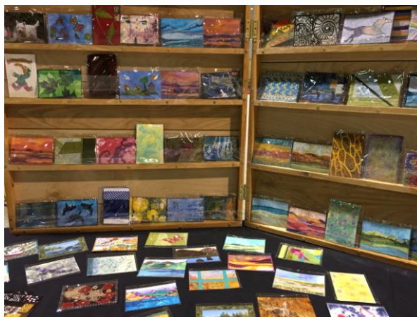
Postcards on display at Fibrefest